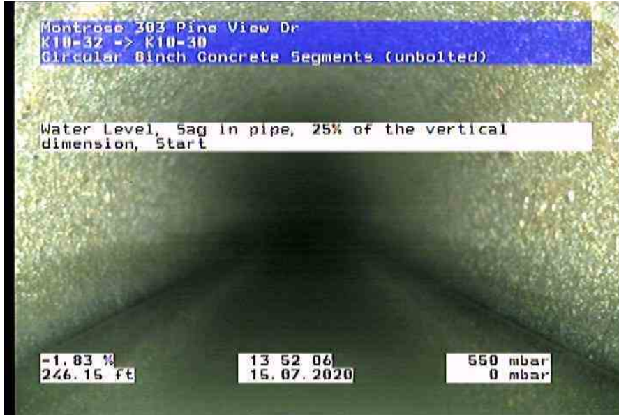
2228_b5ab8652-b41e-49a4-885c-b8cb8b897273_20200715_135730_358.jpg, 00:21:54, 246.15ft Water Level, Sag in pipe, 25% of the vertical dimension, Start