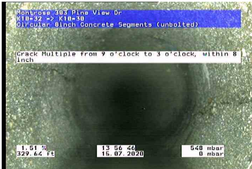
2228_a44f2908-a759-4ed5-8667-4e5d0e5d63cb_20200715_140211_021.jpg,00:26:35,329.64ft Crack Multiple from 9 o'clock to 3 o'clock, within 8 inch