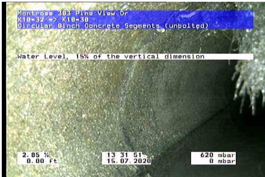
2228_e53a7f1e-6a39-4ca0-87ec-dc04e11d0523_20200715_133714_820.jpg, 00:01:37, 0.00ft Water Level, 15% of the vertical dimension