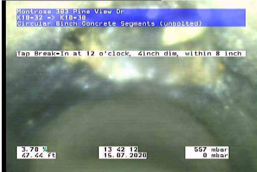
2228_2dbd9bcb-5e02-401b-99bb-f47ce28bdac8_20200715_134736_863.jpg, 00:12:00, 47.44ft Tap Break-In at 12 o'clock, 4inch dim, within 8 inch