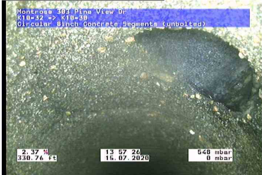
2228_727aeaf4-5976-4fad-988b-c57f114d482c_20200715_140250_745.jpg, 00:27:15, 330.76ft Tap Break-In at 1 o'clock, 4inch dim, within 8 inch