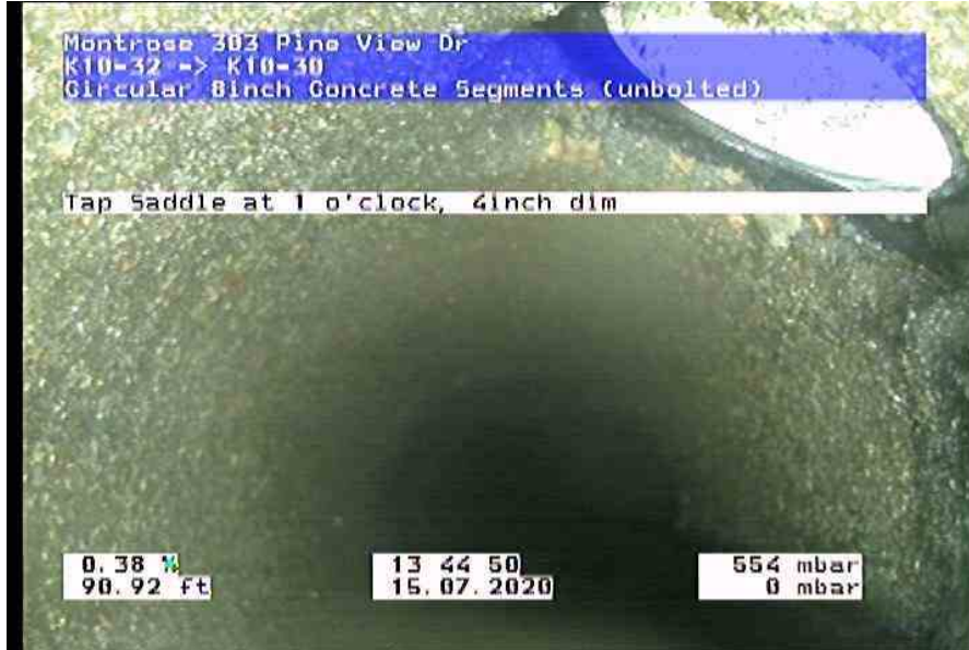
2228_99ba0852-de46-4062-a44f-7c0fef3b7eec_20200715_135014_771.jpg, 00:14:38, 90.92ft Tap Saddle at 1 o'clock, 4inch dim