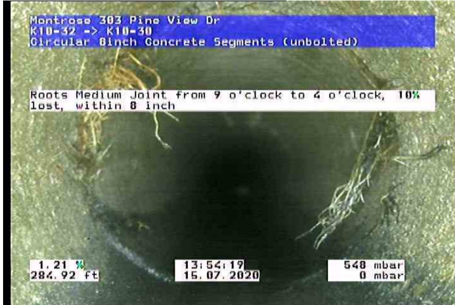
2228_ab9907ea-eb6a-4646-a853-5d6d51be4a70_20200715_135943_645.jpg,00:24:07, 284.92ft Roots Medium Joint from 9 o'clock to 4 o'clock, 10% lost, within 8 inch