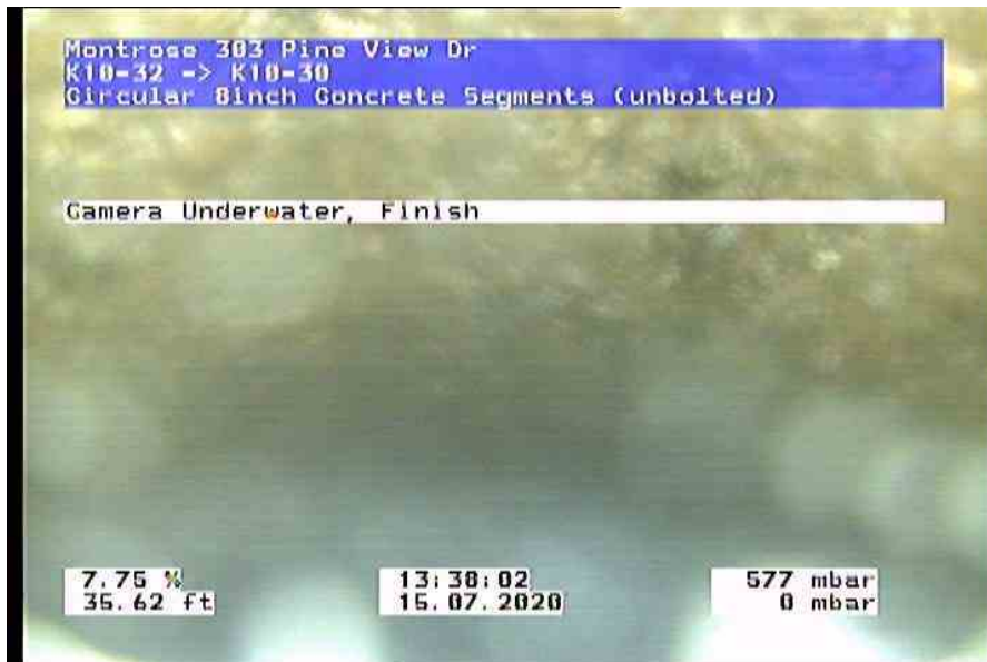
2228_89acee2a-3ab7-4cac-94aa-02ee1a2cc9a1_20200715_134326_564.jpg, 00:07:50, 35.62ft Camera Underwater, Finish