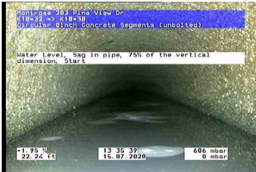
2228_04a1fd56-3379-4f69-ac94-100553f8bd91_20200715_134103_267.jpg, 00:05:27, 22.24ft Water Level, Sag in pipe, 75% of the vertical dimension, Start