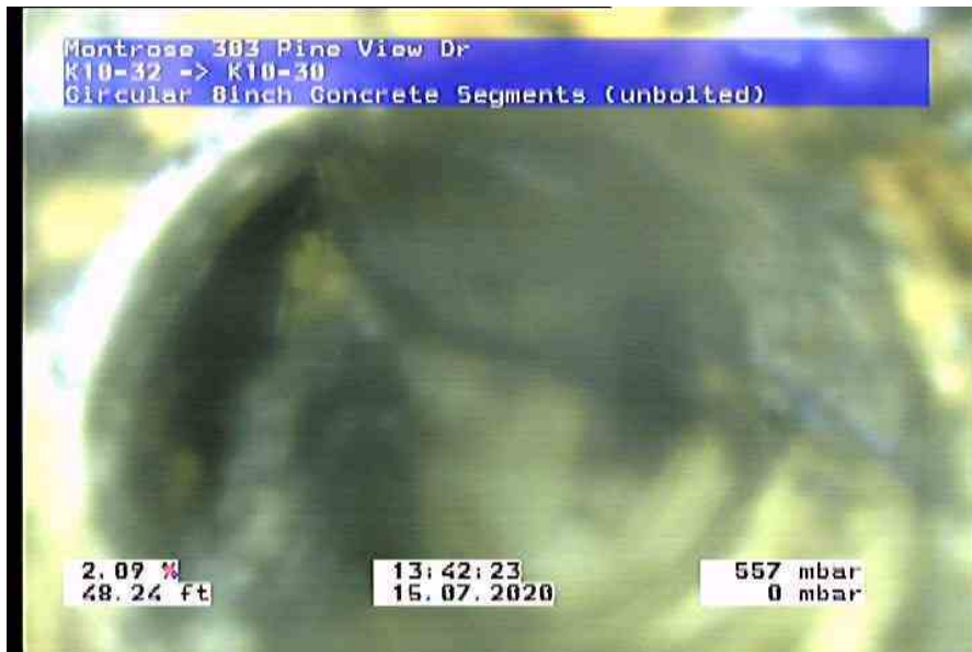
2228_62f267f0-a545-457f-817c-58232b37ebe6_20200715_134748_212.jpg, 00:12:00, 47.44ft Tap Break-In at 12 o'clock, 4inch dim, within 8 inch