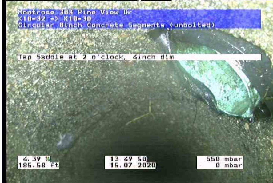
2228_dbf51b7f-7b05-4133-9008-7e1feaa3a52f_20200715_135514_267.jpg, 00:19:38, 185.58ft Tap Saddle at 2 o'clock, 4inch dim