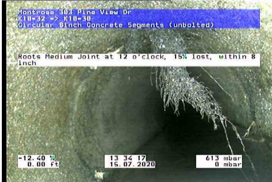
2228_51ffa686-4aab-4f44-b41b-f2d858aa5581_20200715_133941_318.jpg, 00:04:03, 0.00ft Roots Medium Joint at 12 o'clock, 15% lost, within 8 inch