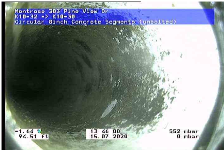
2228_b72f6a17-5c34-46ca-84f9-cf57fb2e9347_20200715_135124_593.jpg, 00:15:36, 93.61ft Tap Saddle at 11 o'clock, 4inch dim