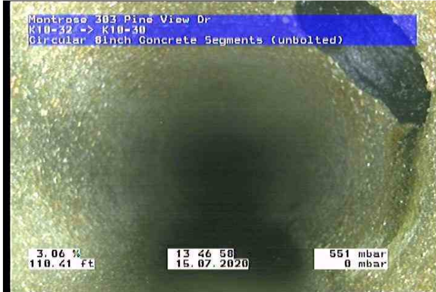
2228_143280a6-1a0a-47d7-871c-b024ee0b3055_20200715_135222_709.jpg, 00:16:37, 110.41ft Tap Break-In at 2 o'clock, 4inch dim