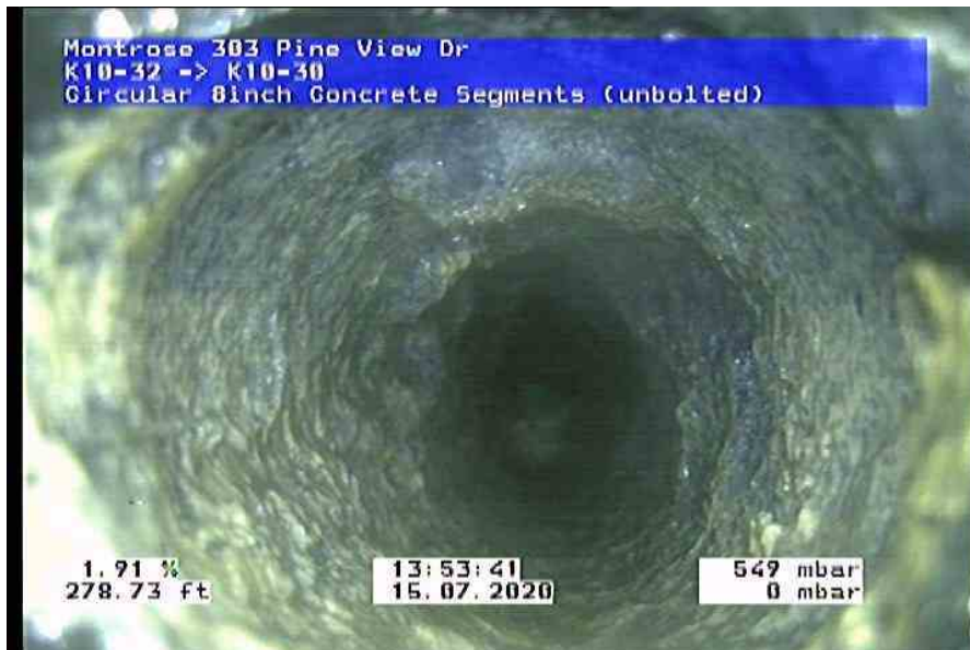
2228_733bafb9-eb6c-4a29-ac94-b47fd3392dfd_20200715_135905_318.jpg, 00:23:20, 277.72ft Tap Break-In at 12 o'clock, 4inch dim