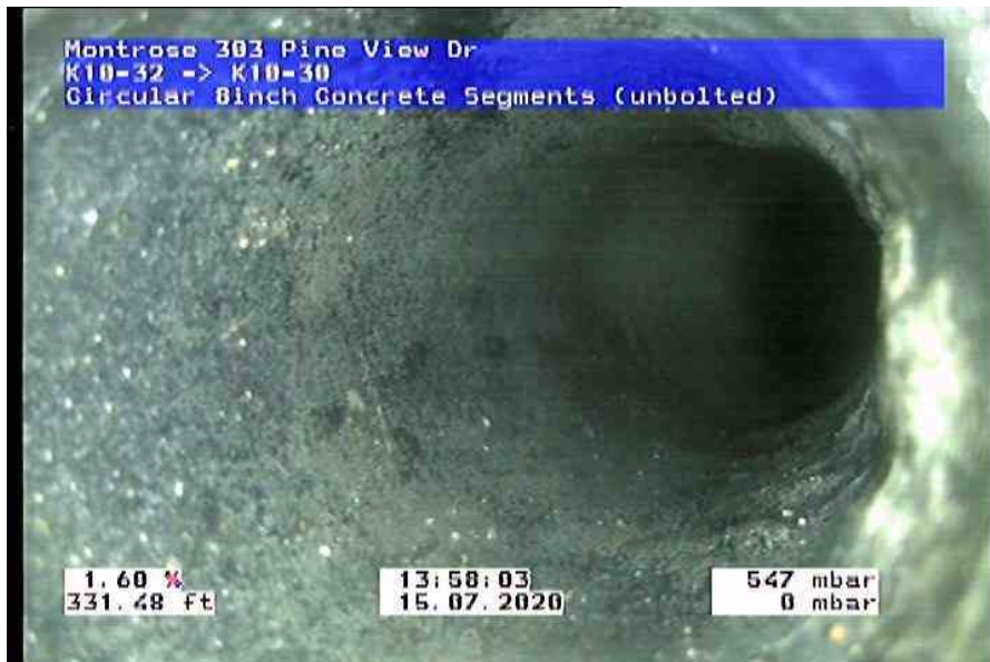
2228_2ecd7da6-1cf9-401b-951b-8c06611d8e08_20200715_140328_184.jpg, 00:27:15, 330.76ft Tap Break-In at 1 o'clock, 4inch dim, within 8 inch