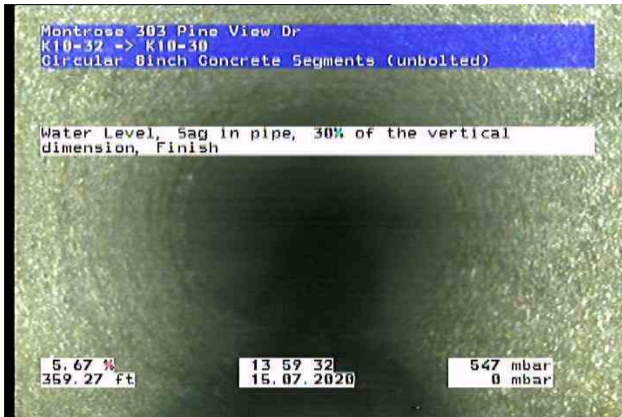
2228_2be6c9c7-9d32-4617-8c23-442fe37856e7_20200715_140457_288.jpg, 00:29:21, 359.27ft Water Level, Sag in pipe, 30% of the vertical dimension, Finish