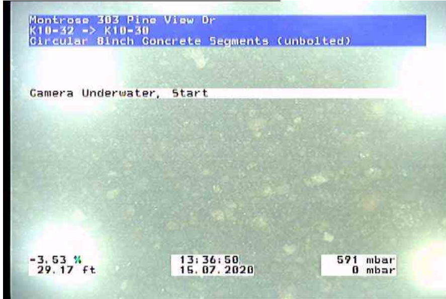
2228_829eebb9-8273-4843-ba39-490ffc60a929_20200715_134214_508.jpg, 00:06:35, 29.17ft Camera Underwater, Start