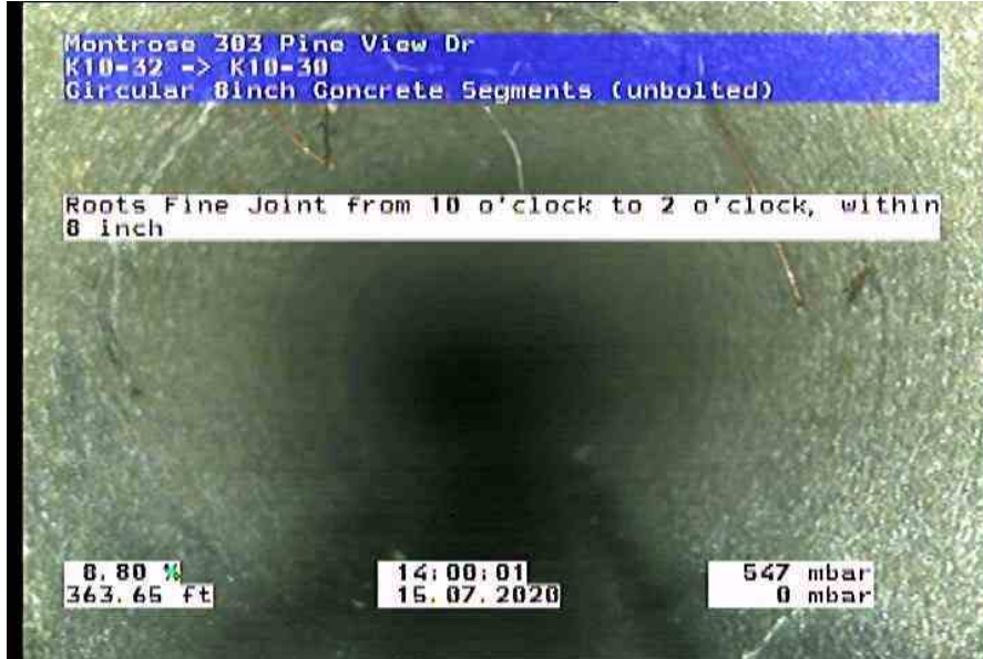
2228_9a07a94a-6273-426a-a1f7-0255191898c6_20200715_140525_848.jpg, 00:29:49, 363.65ft Roots Fine Joint from 10 o'clock to 2 o'clock, within 8 inch