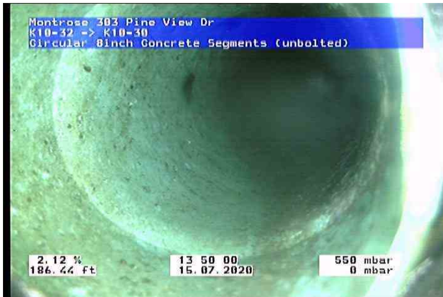
2228_b4cf392b-cdc8-4e1b-ade7-98a0b1d6391a_20200715_135524_453.jpg, 00:19:38, 185.58ft Tap Saddle at 2 o'clock, 4inch dim