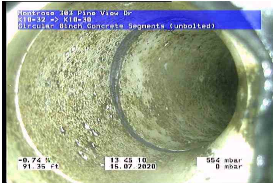
2228_82e42b2b-548a-4636-84be-03c1deecfad_20200715_135035_057.jpg, 00:14:38, 90.92ft Tap Saddle at 1 o'clock, 4inch dim