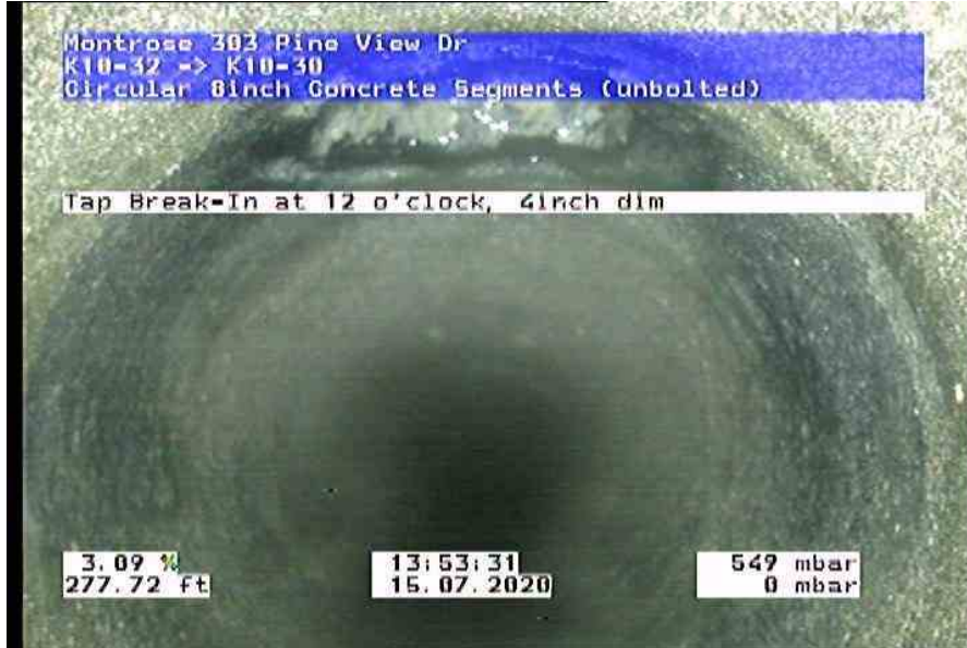
2228_ca9c11ed-dbf4-47a3-bb99-549f4b9cb6a7_20200715_135855_770.jpg, 00:23:20, 277.72ft Tap Break-In at 12 o'clock, 4inch dim