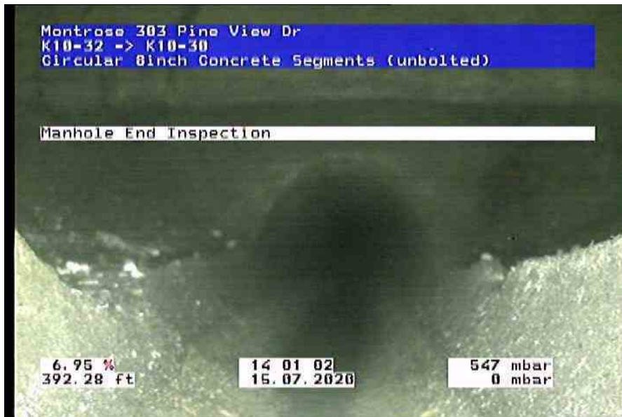
2228_f590738a-008a-4eba-a677-b417b985c4e2_20200715_140627_005.jpg, 00:30:50, 392.28ft Manhole