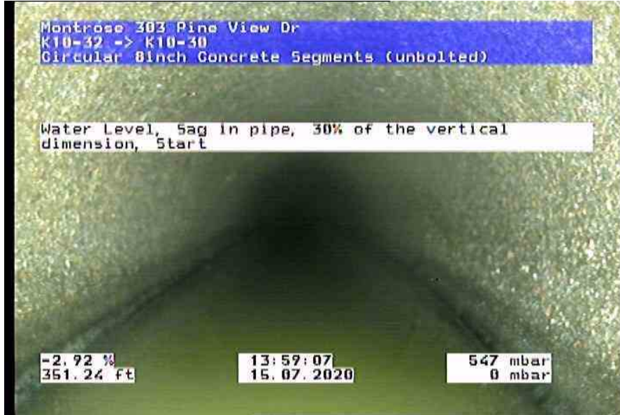
2228_92337048-dfb6-4be7-b115-46b82867cd3f_20200715_140431_314.jpg, 00:28:40, 351.24ft Water Level, Sag in pipe, 30% of the vertical dimension, Start