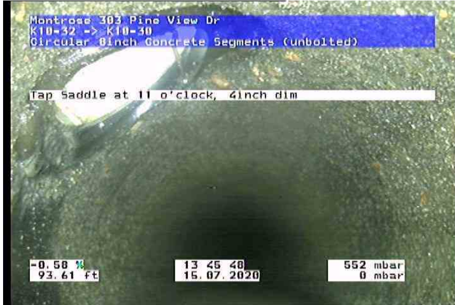
2228_72d1972b-75ff-4086-8dc5-e230b10f25c8_20200715_135112_731.jpg, 00:15:36, 93.61ft Tap Saddle at 11 o'clock, 4inch dim