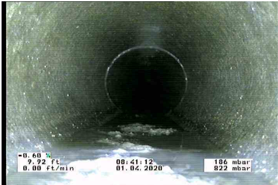
297_724ff749-2ddf-4bee-a7ff-cdeb8c31d9aa_20200401_084556_166.jpg, 00:04:59, 0.00ft Water Level, 5% of the vertical dimension