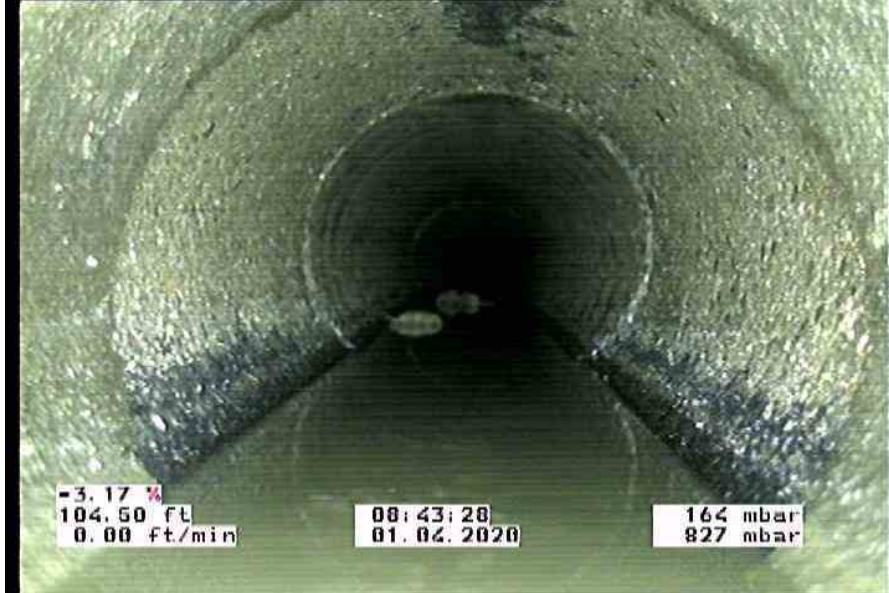
297_6b63931e-ebdd-416f-9d6e-738ecb9f1062_20200401_084812_087.jpg, 00:07:17, 104.50ft Material Change, Concrete pipe (non reinforced)