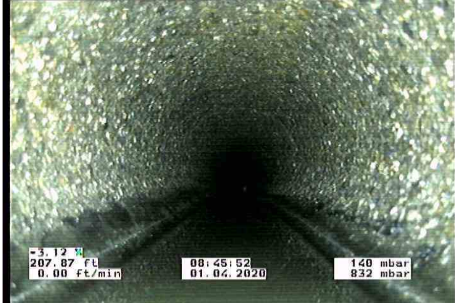
297_1d0c3abe-9945-4fad-9928-6c1ddb29e7_20200401_085036_916.jpg,00:09:41,207.87ft General Photograph