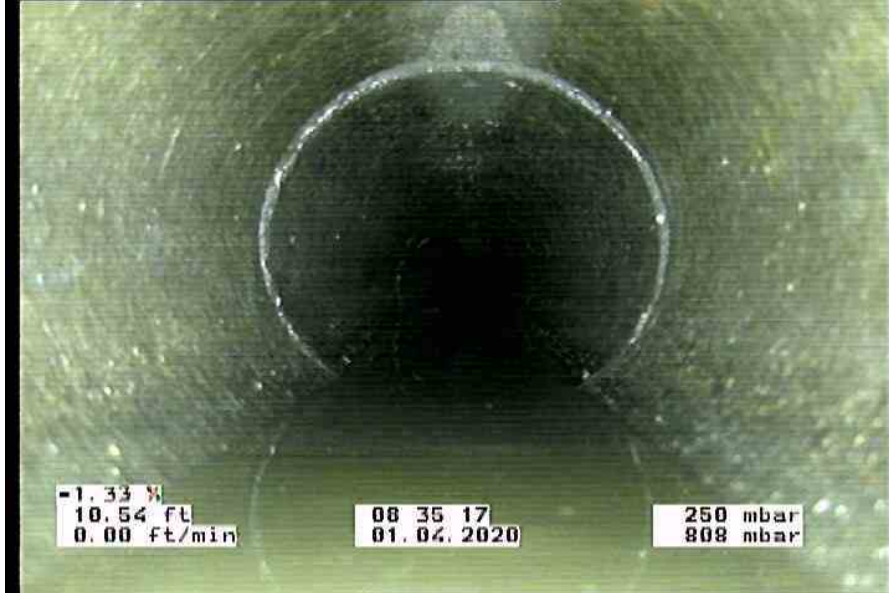
297_d008bb29-2bb9-4398-9bcc-6ca7ab575d7f_20200401_084001_202.jpg, 00:00:00, 0.00ft Manhole