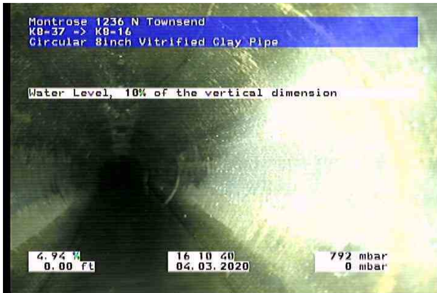
144_34091dd0-0d0f-4300-8e3a-29fd3347e8ac_20200304_151500_946.jpg, 00:00:24, 0.00ft Water Level, 10% of the vertical dimension