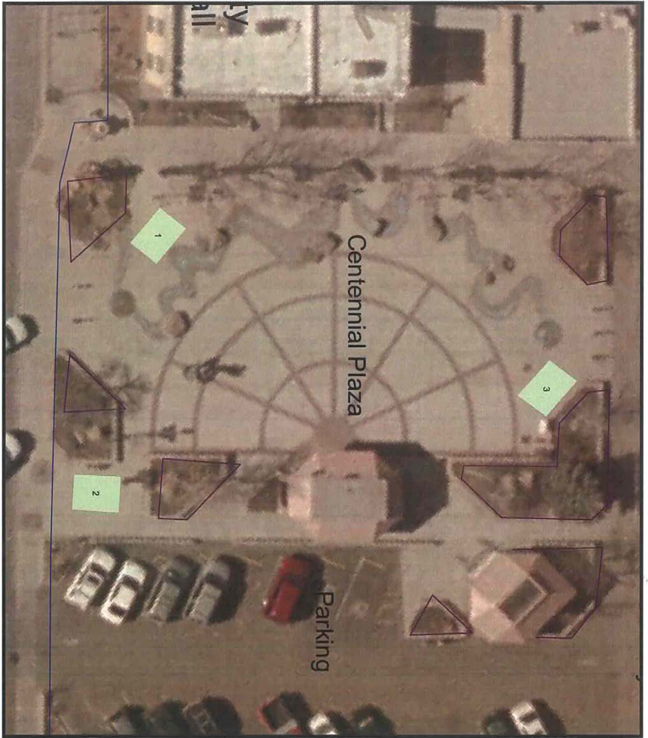
Centennial Plaza Mobile Vendor Map