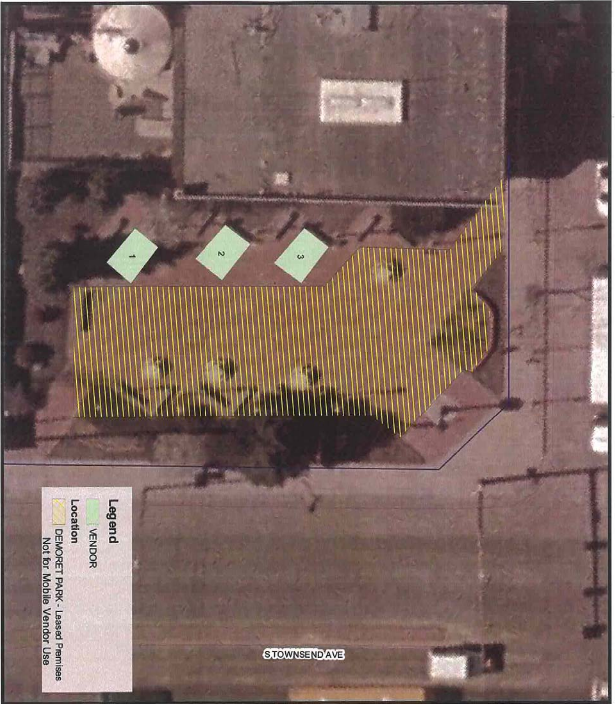
Demoret Park Mobile Vendor Map